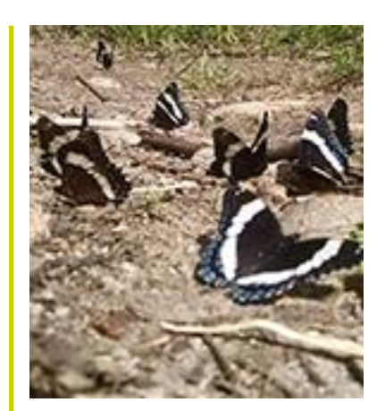
A kaleidoscope of White Admiral butterflies at Sawyer Pond

See Mt. Washington & Mt. Monroe continued on page 6