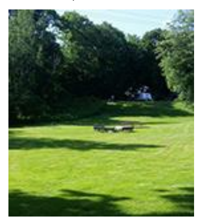
Campground at North Beach