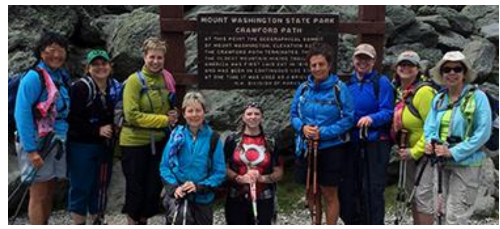
See Mt. Washington & Mt. Monroe continued on page 5