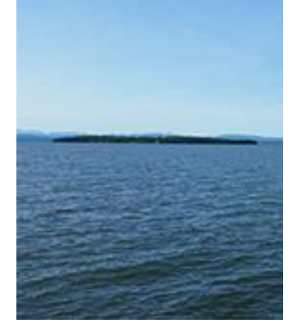
Lake Champlain on the bike route