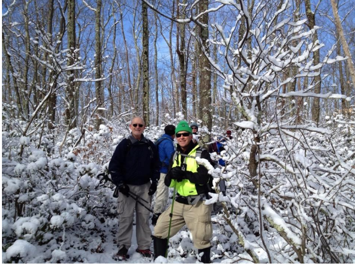
By Lori Tisdell

Pioneer Valley Hiking Club PO Box 225 West Springfield MA 01090-0225 (Dues are $25 member, $40 family, and $15 for students)