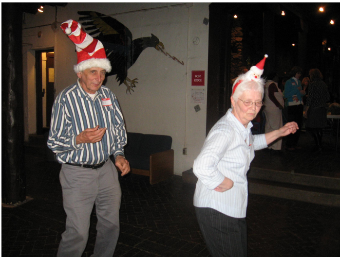
Getting into the Spirit of the Season