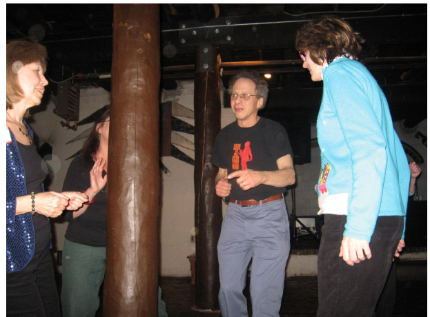
Dancing the Night away