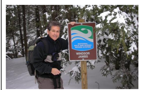
Our resident photographer