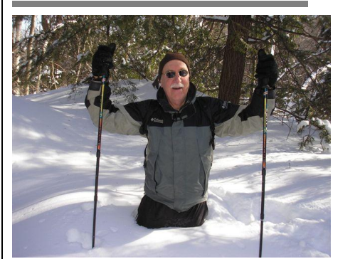
Post holing full body style

the spirits inscribed in the Hutos long shelf of registration books, paid my respects to Jack London, and found a bunk space for the restful slumber of a below zero night.