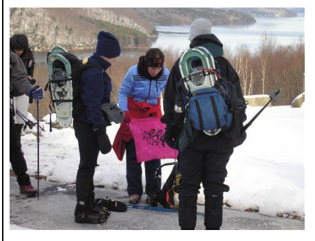
<u>I read that this color would scare</u> <u>away the bears!</u>