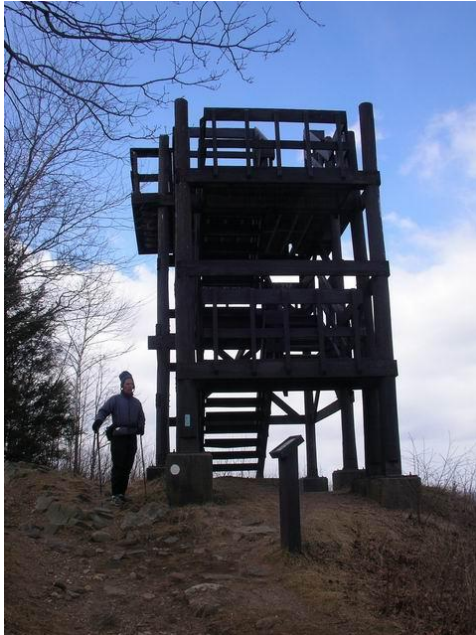
{Shenipsit – continued from page 1}

geocache! It's a 150-year-old sport that uses references to landmarks and clues embedded in stories, back before we had GPS technology, to hide and seek the hidden journals and a unique ink stamp for each letterbox.