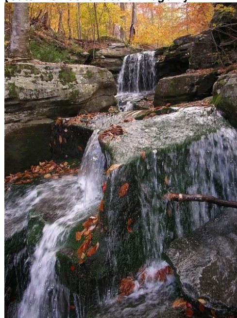
Waterfalls in the Catskills

A few years ago I climbed my first peaks in the Catskills; Windham High Peak and the Blackhead range. If you drive toward Albany you have no doubt seen the majestic peaks of the Blackhead range south of the turnpike. This was the summer of 2003 and I had {Catskills - continued on Page 2.}