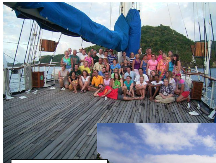
S.S. Yankee Clipper Windjammer Cruise