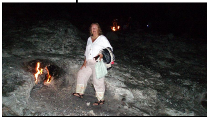
Fire at Chimera

Arycanda we had lunch at the caretaker's house prepared by his wife. That night the bus driver's wife prepared a wonderful dinner and they took us up to their house. They had two sons who were outside playing most of the time. Both women did not work outside the home. In the evening as we sat there relaxing after dinner the men helped put away the food and all the clean up. This wife was bareheaded throughout the evening but she had a new scarf she was trying on later so we assume she may wear one when she goes out.