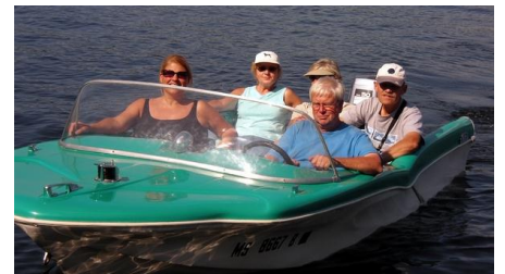
Touring Wyola Lake