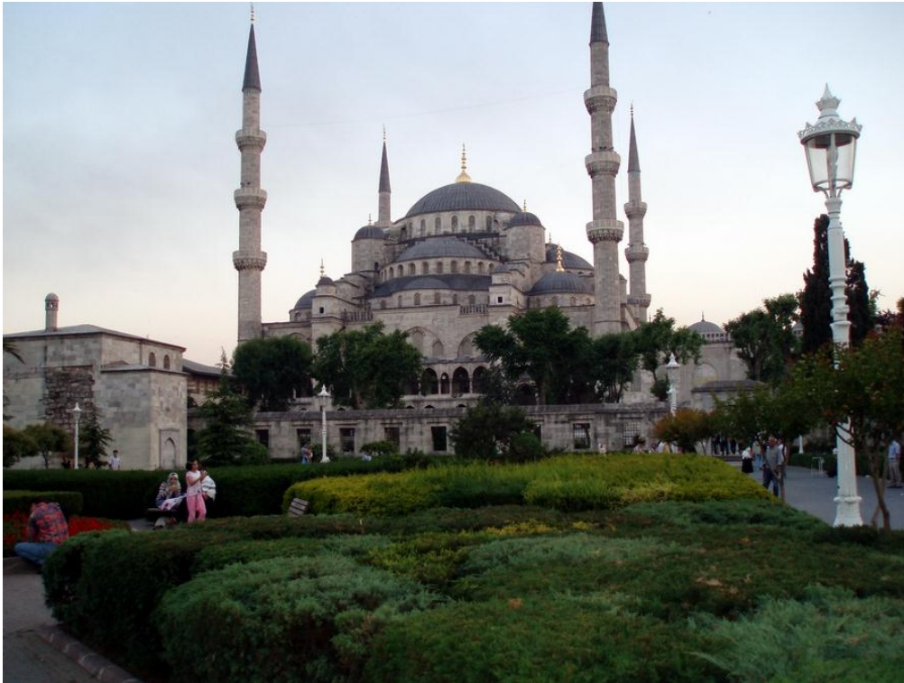
Blue Mosque