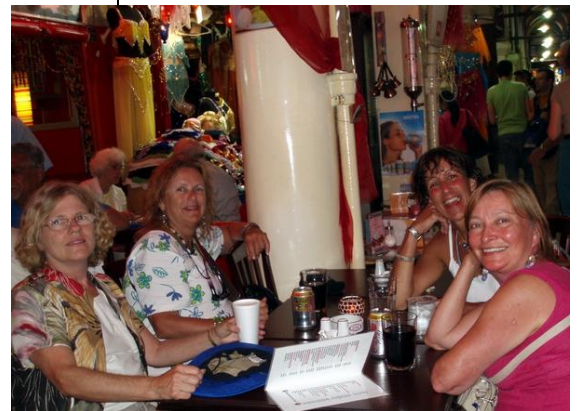
Last Day in Turkey