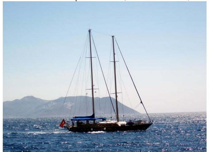
Sailing the Mediterranean