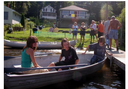
Lake House from the Dock