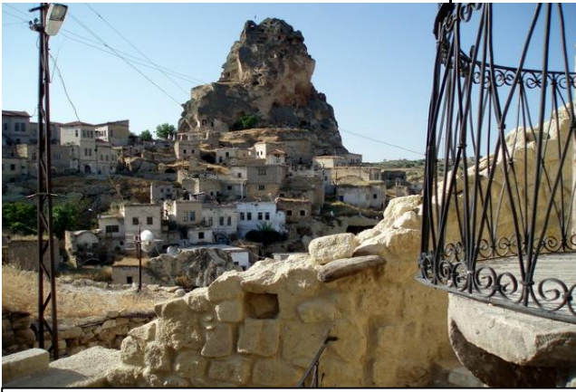
View from Capadocia Hotel Room

Arycanda we had lunch at the caretaker's house prepared by his wife. That night the bus driver's wife prepared a wonderful dinner and they took us up to their house. They had two sons who were outside playing most of the time. Both women did not work outside the home. In the evening as we sat there relaxing after dinner the men helped put away the food and all the clean up. This wife was bareheaded throughout the evening but she had a new scarf she was trying on later so we assume she may wear one when she goes out.