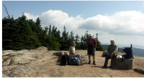
"Unsuspecting hikers enjoying Osceola"