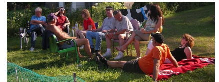
Picnic on the green