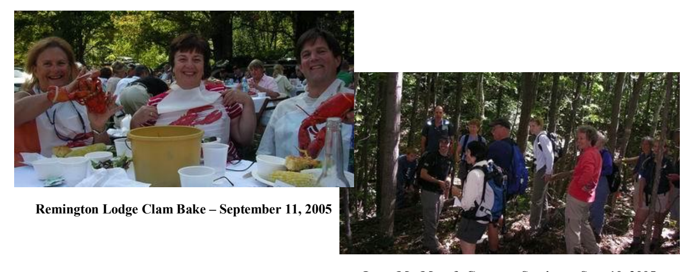
Long Mt. Map & Compass Seminar-Sept 10, 2005