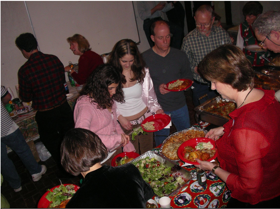
PVHC Holiday Party – Living up to our reputation as the øHiking & Dinning Clubø