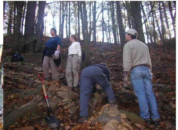
November M-M Trail Maintenance Day