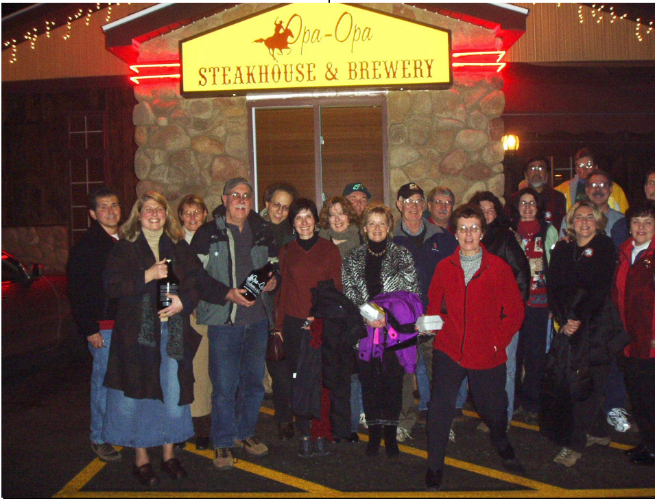
First Night – Dinner at Opa Opa before ringing in the New Year.