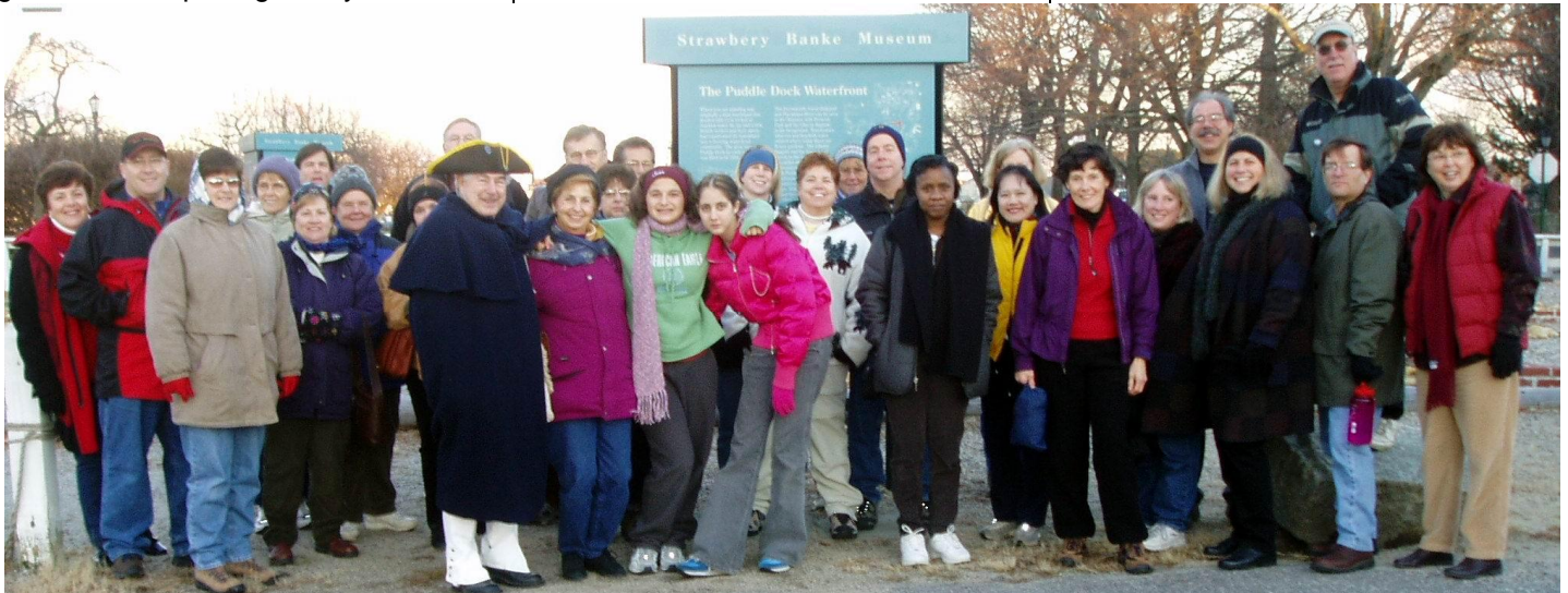
PVHC at Strawbery Banke – Candle Light Stroll

Before Steph and me woke up grumpily the next morning, everyone else went downstairs and had a breakfast that I cannot honestly say I