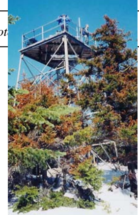
Mt. Ascutney Summit

again. We reached Boyce Shelter and decided to have lunch. It was a very short lunch. I was going to eat a