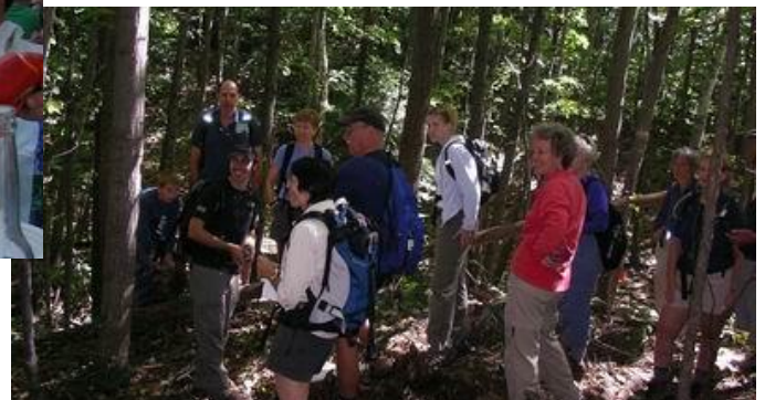
Long Mt. Map & Compass Seminar– Sept 10, 2005