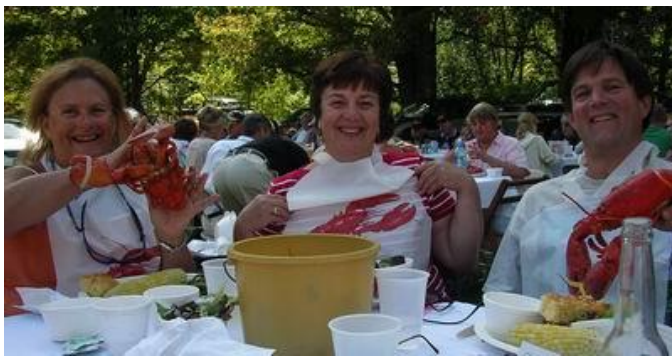
Remington Lodge Clam Bake – September 11, 2005