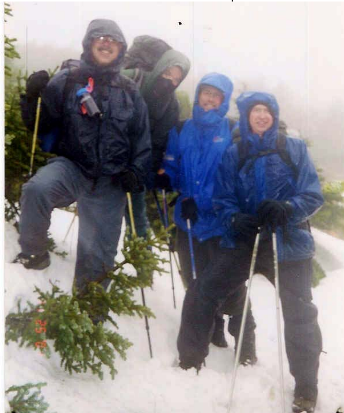
Just off the Summit and out of the wind on Moosilauke

One of the club officers was on this easy hike. He shall remain unnamed so his reputation as a tough hiker and great outdoorsman